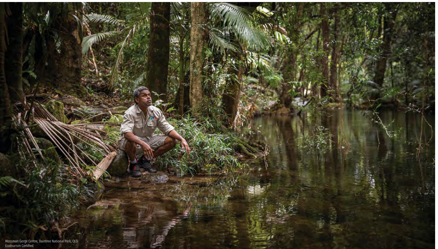
Mossman Gorge Centre, Daintree National Park, QLD Ecotourism Certified

Interpretation and education form important components of any ecotourism experience, therefore it is essential that all staff and guides providing interpretation are trained, aware and have sound understanding of the subject matter, communications and delivery methods.