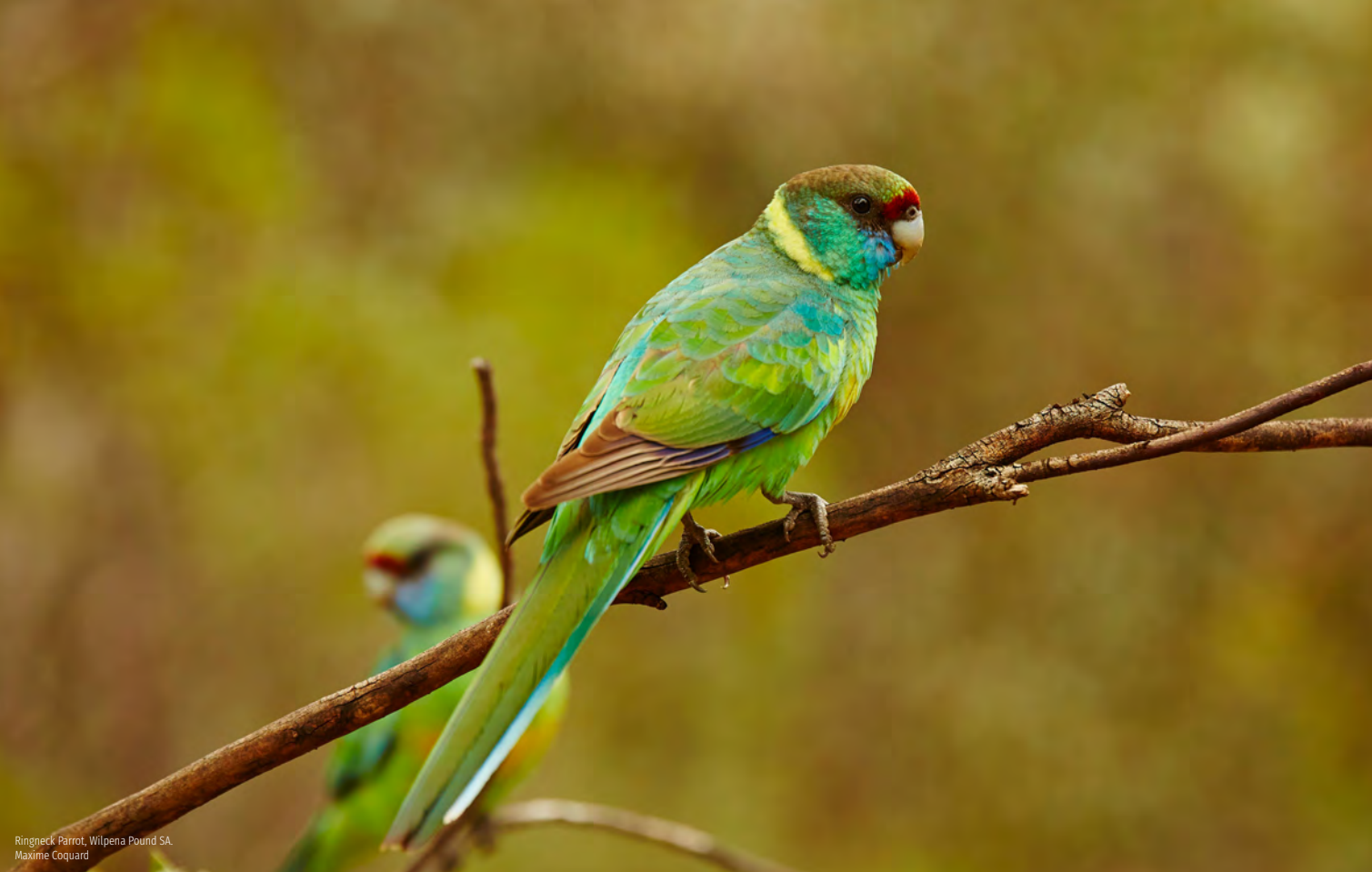
Ringneck Parrot, Wilpena Pound SA.