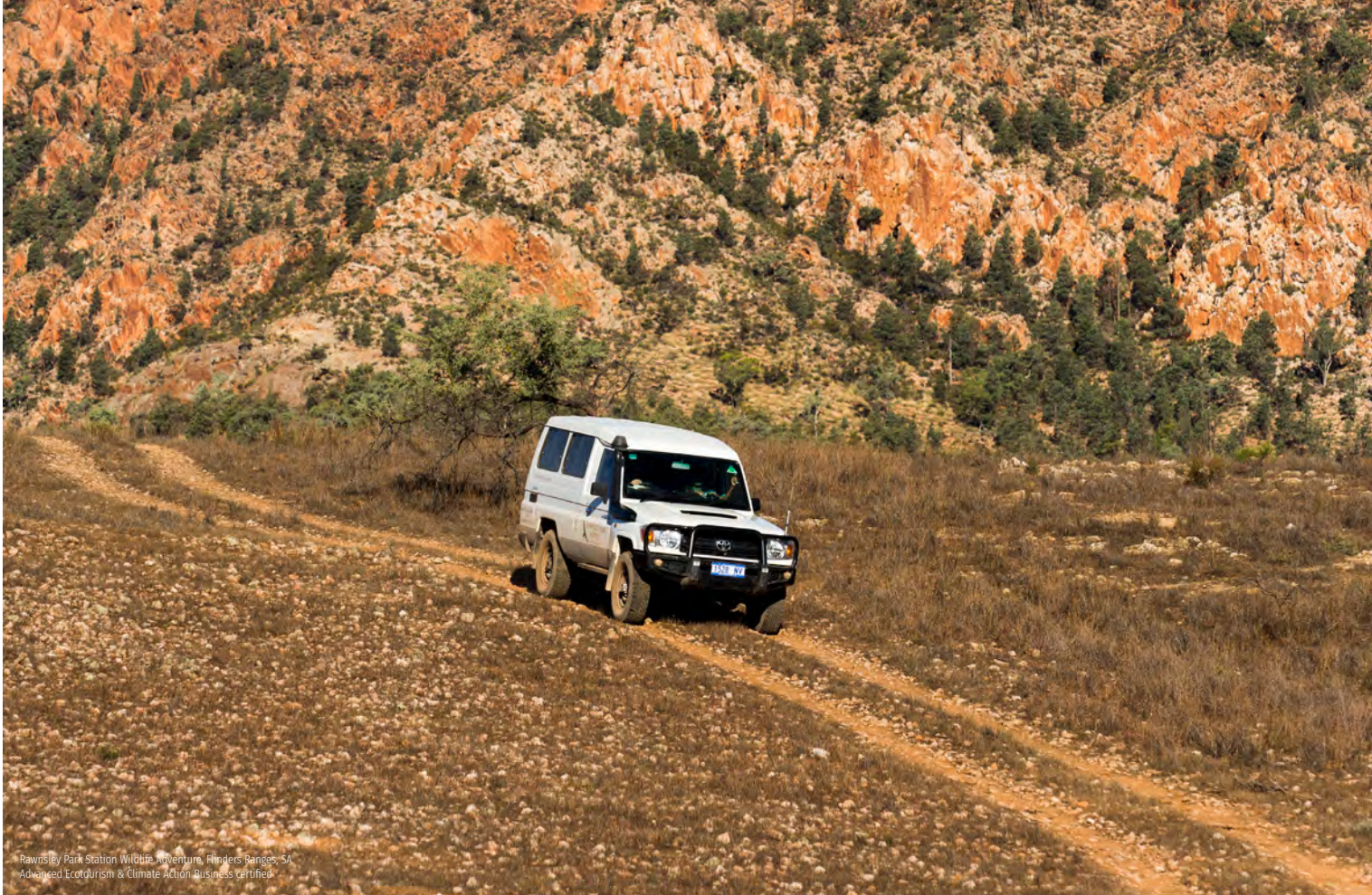
Rawnsley Park Station Wildlife Adventure, Flinders Ranges, SA Advanced Ecotourism & Climate Action Business certified