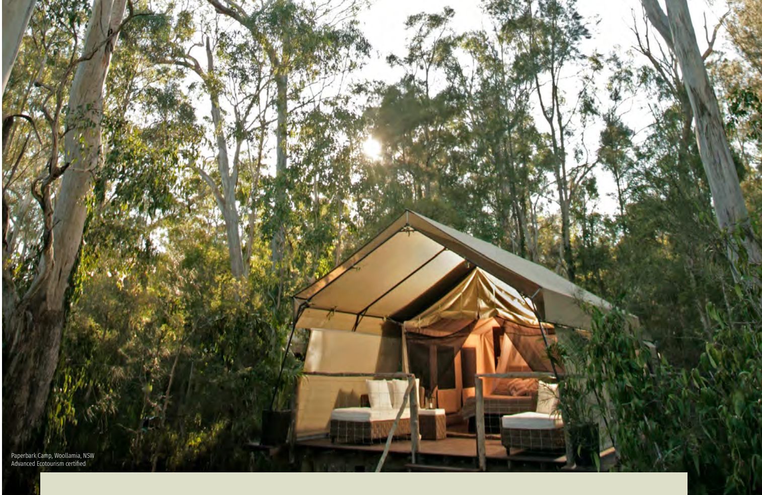
Paperbark Camp, Woollamia, NSW Advanced Ecotourism certified