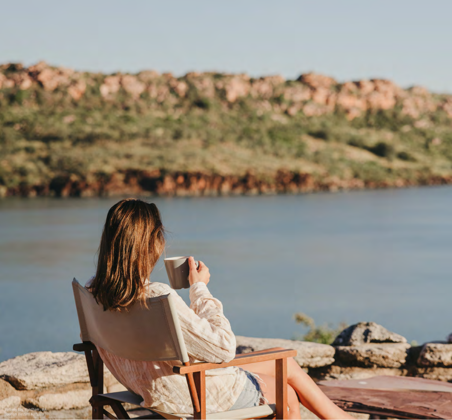
Faraway Bay, Wyndham, WA Tourism Western Australia