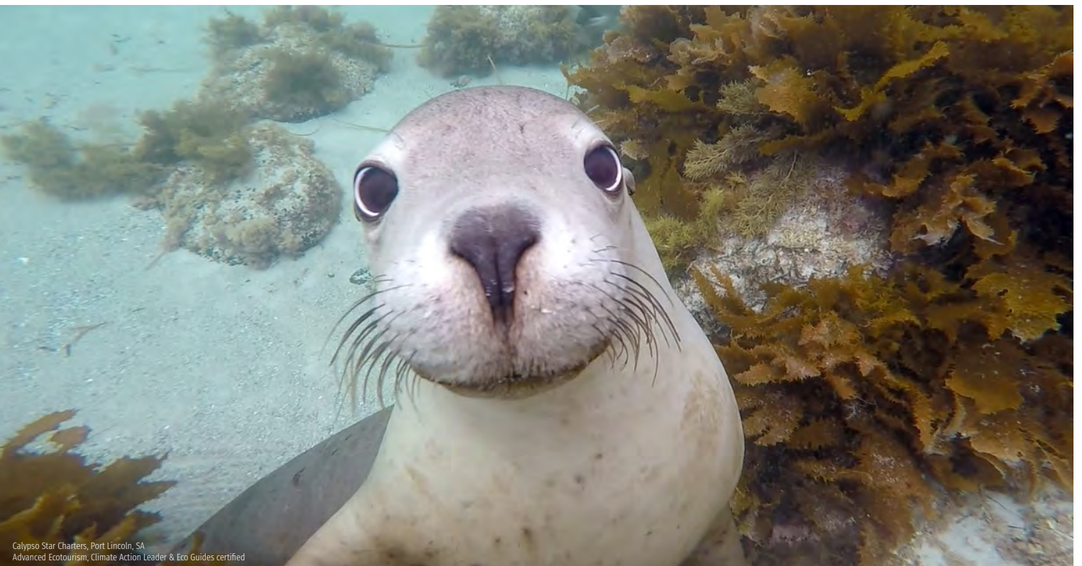
Calypso Star Charters, Port Lincoln, SA Advanced Ecotourism, Climate Action Leader & Eco Guides certified