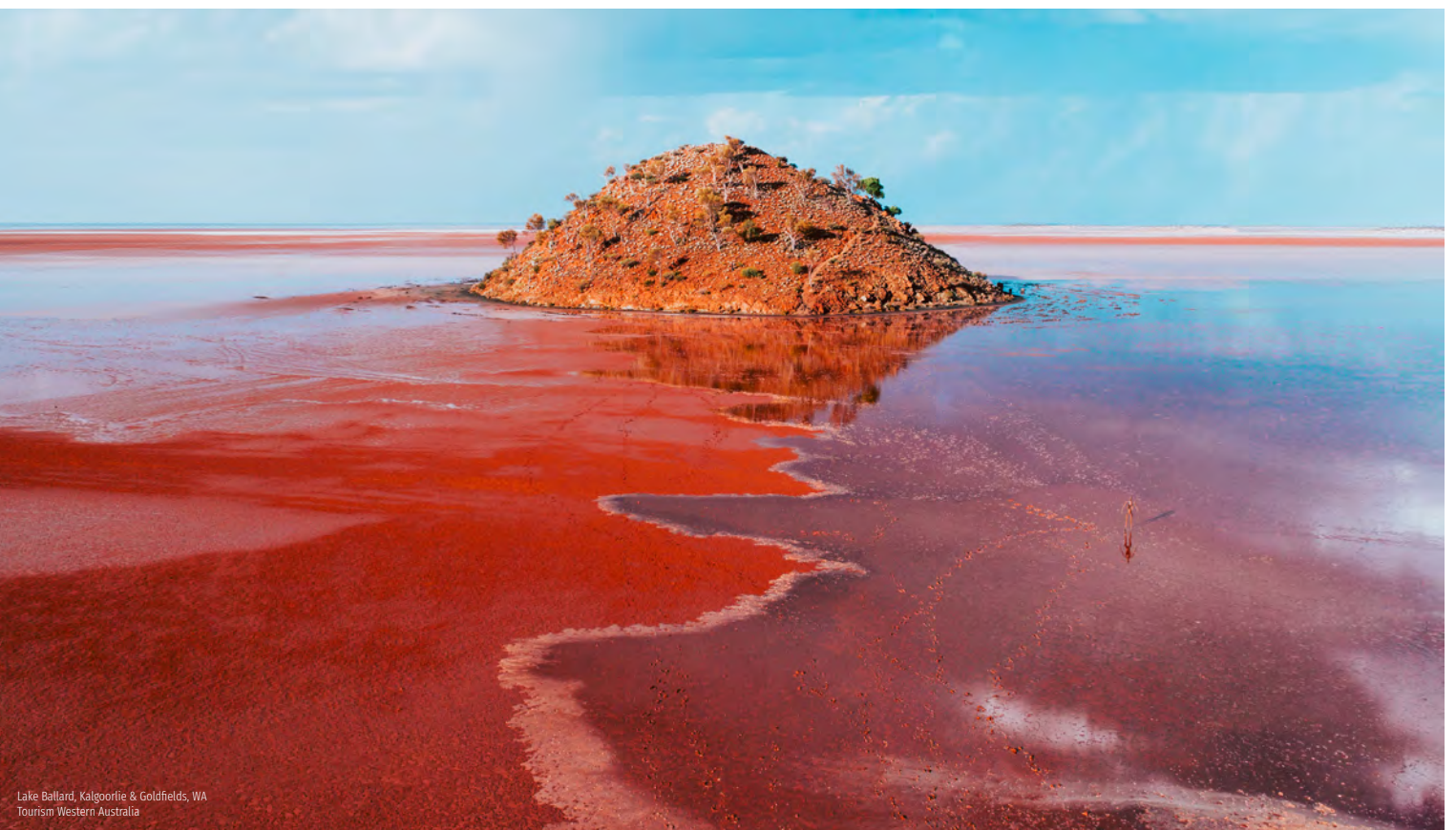
Lake Ballard, Kalgoorlie & Goldfields, WA

Tourism operations should use and promote Indigenous goods and services while ensuring they are authentic. A formal agreement for purchase, distribution and/or promotion may be in place and all copyright patent and intellectual laws must be adhered to.